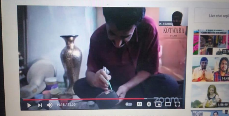
ARTS & CRAFTS OF KASHMIR-KASHMIR PAPER MACHE -WEVING DREAMS CRAFTING LIVES