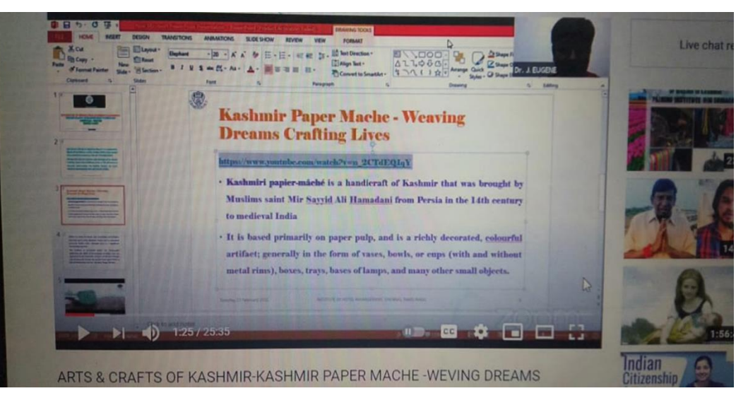
A note on Kashmiri Paper Mache